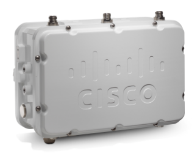
Figure 1. Cisco Aironet 1520 Series

The Cisco Aironet 1520 Series supports dual-band radios compliant with IEEE 802.11a and 802.11b/g standards. Various uplink connectivity options are supported such as Gigabit Ethernet (1000BaseT), and small form-factor pluggable (SFP) slot for fiber (100BaseBX) or cable modem interface. Power options supported includes 480VAC, 12VDC, cable power, Power over Ethernet (POE), and internal battery backup power. It also employs <u>Cisco's Adaptive Wireless Path Protocol</u> (<u>AWPP</u>) to form a dynamic wireless mesh network between remote access points, while delivering secure, high-capacity wireless access to any Wi-Fi-compliant client device (Figure 2).